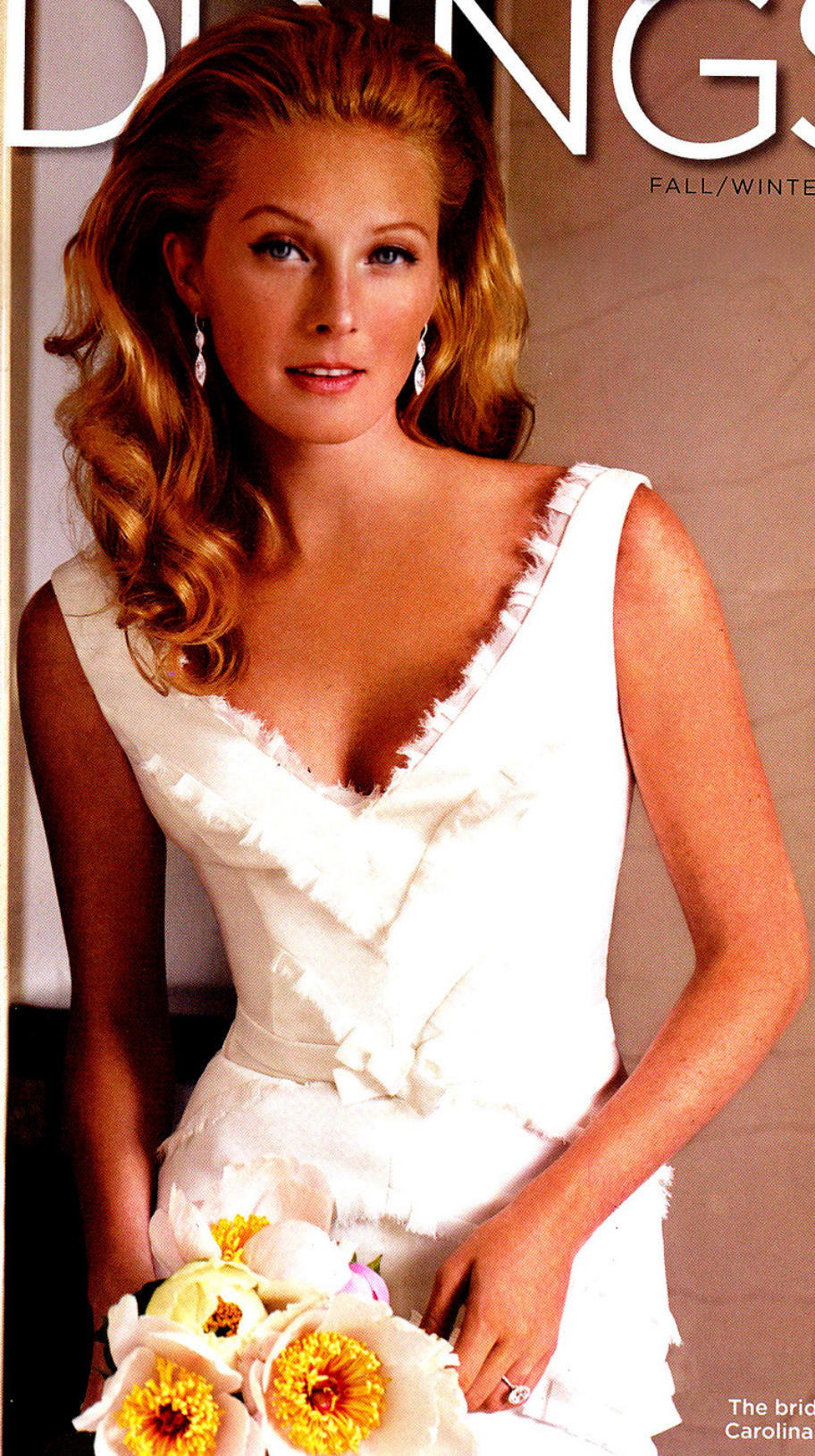
The bride wears Carolina Herrera